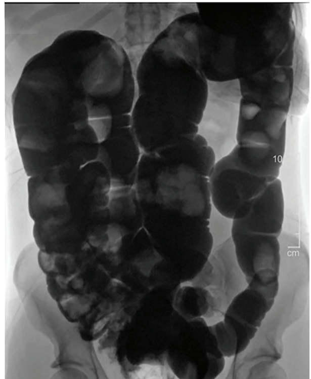
Figure 4: CT Diatrizoate meglumine (DM) enema with air contrast. DM flows retrograde from the rectum to the cecum without evidence of obstruction or mass.

b) Colonoscopy: Colonoscopy can be technically challenging in patients with dolichocolon, although it remains a valuable diagnostic and therapeutic tool for many gastrointestinal disorders. Navigating the colonoscope and reaching the cecum can be difficult due to excessive looping and angulation. These challenges often necessitate the use of a longer endoscope and an experienced endoscopist. Trecca et