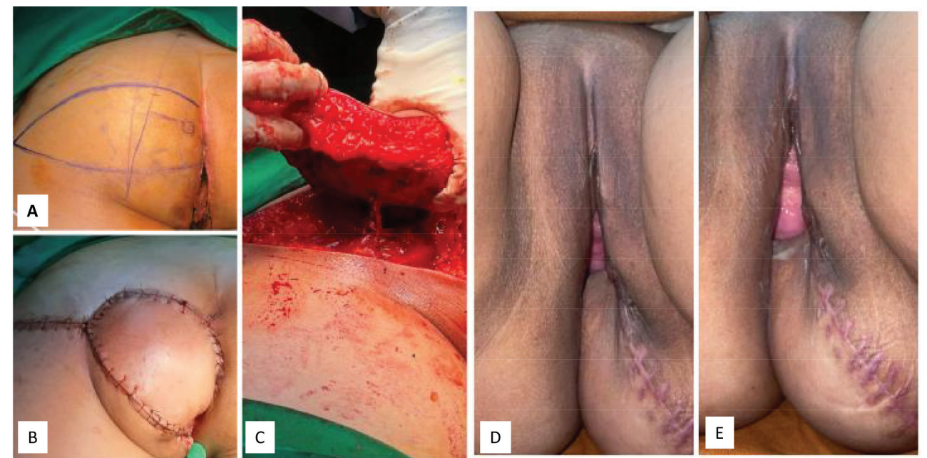
Figure 2: Reconstruction: (A) flap design; (B) final result; (D) raised flap; (D,E) follow-up three months after surgery.

was chosen, strong pulsation was confirmed with the hand-held Doppler, and the perforator was dissected to the main branch (approximately 3 cm) to achieve a loose pedicle and twisting-free propeller flap. An inferior incision was carried on until the flap was isolated. The flap was then rotated 180 degrees to reach the defect. The secondary defect was then closed primarily. A total of 100 ml of blood was lost throughout the 175-minute operation.