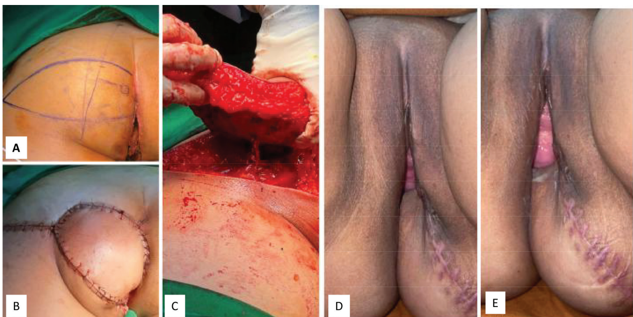
Figure 2: Reconstruction: (A) flap design; (B) final result; (C) raised flap; (D,E) follow-up three months after surgery.

was chosen, strong pulsation was confirmed with the hand-held Doppler, and the perforator was dissected to the main branch (approximately 3 cm) to achieve a loose pedicle and twisting-free propeller flap. An inferior incision was carried on until the flap was isolated. The flap was then rotated 180 degrees to reach the defect. The secondary defect was then closed primarily. A total of 100 ml of blood was lost throughout the 175-minute operation.