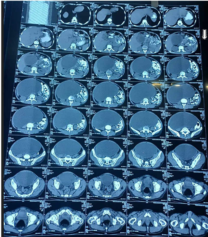
Figure 1: Computed tomography images of the abdomen show a large cystic mass lesion measuring approximately 22.9×13.4 cm (average HU=18) with multiple enhancing septae on the right side of the abdomen.

A very uncommon type of gastrointestinal duplication known as a completely isolated duplication cyst lacks communication with the rest of the normal intestine segment and has its own blood supply (5-7). Here, we present the case of an adult male with a non-communicating ileal duplication cyst.