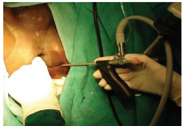
Figure 2. Fistuloscope Introduction Through External Fistula Opening During Video-Assisted Anal Fistula Treatment (27)

In the last decade lots of articles have been published about AFP. According to articles, there are variable success and failure rates of AFP reported (29). According to some studies from USA (30-32), China (33) and Italy (34, 35) the success rate of AFP was between 25-85%. Some studies point out that the success rate depends on factors like multiple prior attempts for closure (36), pervious surgery (37, 38), incontinence (39), complicity of fistula (40), cost