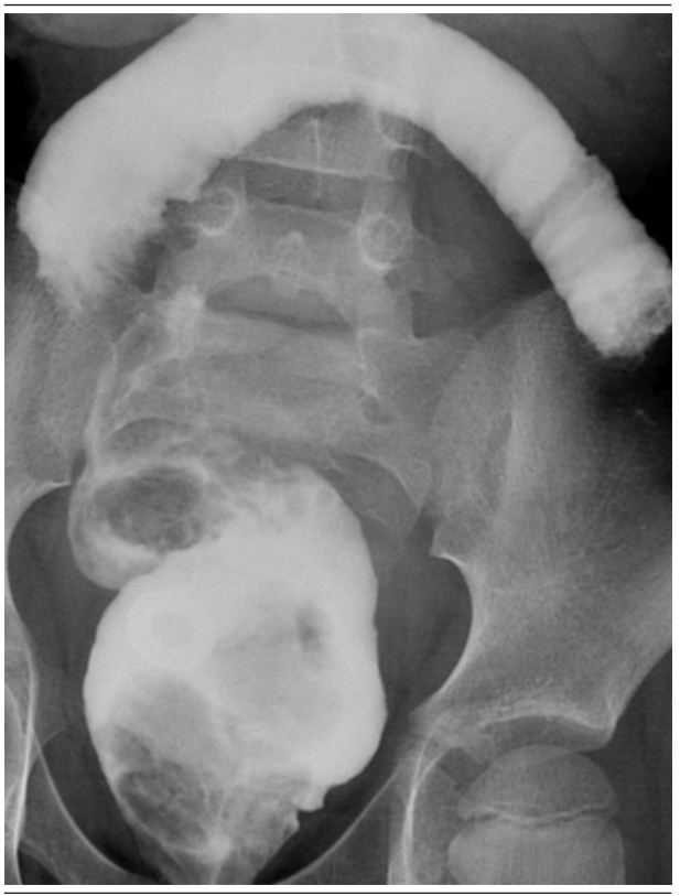
Figure 1. Vertical Reduction of Megarectum and Excision of Dilated Segment of Sigmoid Colon

VRR is a novel technique described in the surgical treatment of megarectum. In this technique, reduction of rectum capacity is achieved by linear plan excision of the antimesenteric section of the enlarged rectum and thus, restores perception of rectal fullness and improves sensation and bowel function. According to the available literature, only 16 adult patients in two case series were operated via this technique; Williams et al. who are the first to describe this technique, reported 83% success rate, 33% morbidity, and no mortality in these patients (2, 3).